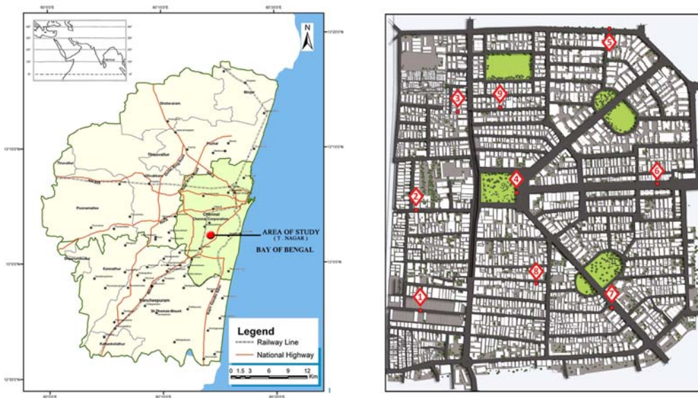
Fig. 1 Location of neighbourhood in Chennai Metropolis and the nine measurement locations.