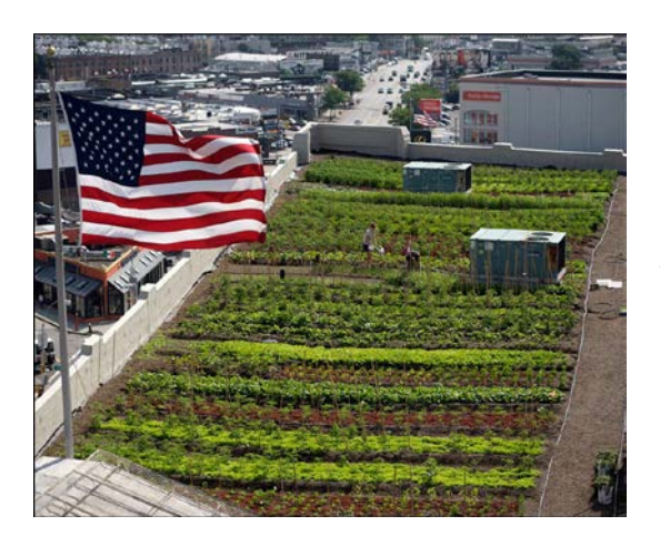
Fig. 3 Brooklyn Grange, Urban rooftop farm, New York (ghassancontracting.wordpress.com).

As they are sometimes called, "living roofs" are alive and can interact with their environment. If this technique is used at a wider scale in coming years to refresh cities (Figure 3), it is important to check whether they could induce some environmental or public health inconveniences.