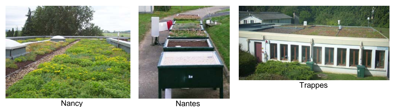
Fig. 2 The 3 experimental sites, Nancy, Nantes, Trappes.

It is then essential to measure, on various experimental sites (Figure 2), the parameters necessary for the validation of the model ( sub-task 1.1 ). Besides the need for data for modeling ( sub-task 1.2 ), these observations will also allow to constitute a database on the physical properties of the VGR, still little known and which can be useful for the whole scientific community. A study of the evolution of the precipitation and the temperatures on 3 target cities within the framework of a climate change ( sub-task 1.3 ) will allow a better adequacy between the choice of the nature of devices, their number and their location. In this frame, the use of the scenarios of the project GICC DRIAS will be relevant [ Lémond et al, 2011 ].