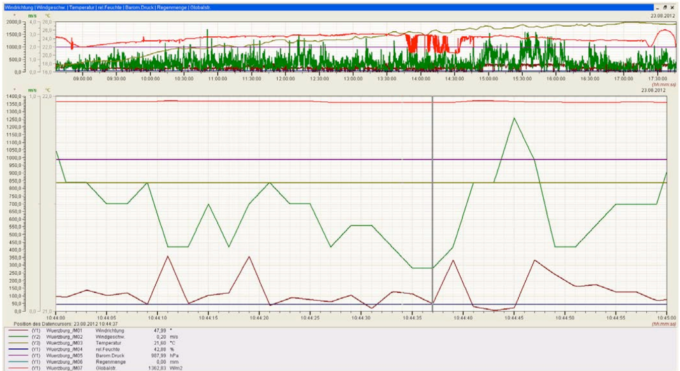
Fig. 4: Recorded data and graphs of a measurement of a weather station

At least, the data of the USB logger, which measures the temperature as well as the relative humidity, are included to compare with the ones of the weather stations ensuring the results at the height of about one meter and close to the trunk.