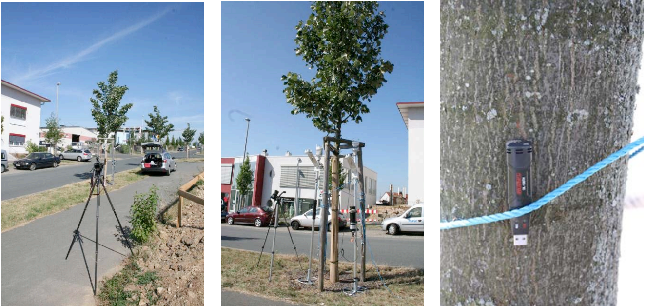
Fig. 2: Measurement setup around a silver-linden tree

In prospective, a new type of thermal imager will be deployed, that approaches both a high resolution picture (thermal and real-time) and provides the possibility to record thermal images and videos at the same time. With this option, the research will achieve a higher level, because the progress of turning leaves will be better comprehensible and a certain temperature might be figured out of the turning action. In order to reach an obvious result, trees of different sizes and ages need to be estimated. At least, for securing the results of the weather stations and for being able to compare them, an additional USB data logger for temperature and relative humidity is attached close to each tree at the top of the trunk, where the growth of crown leaves starts (s. fig. 2, right side). This data is supposed to confirm the data of the weather stations.