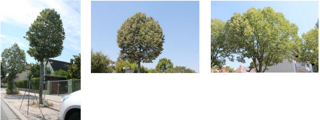
Fig. 1: Trees of different ages (0 – 10 years; 10 – 25 years, 25 years and older)

This categorization does not represent a final process, it is rather a preselection for further measurements. At least, this kind of categorization is required to comprehend, if trees of different age groups all act the same way. Actually, it is assumed that the crown of trees in younger periods acts more active, than older ones do. So, a comparison of the trees can be performed.