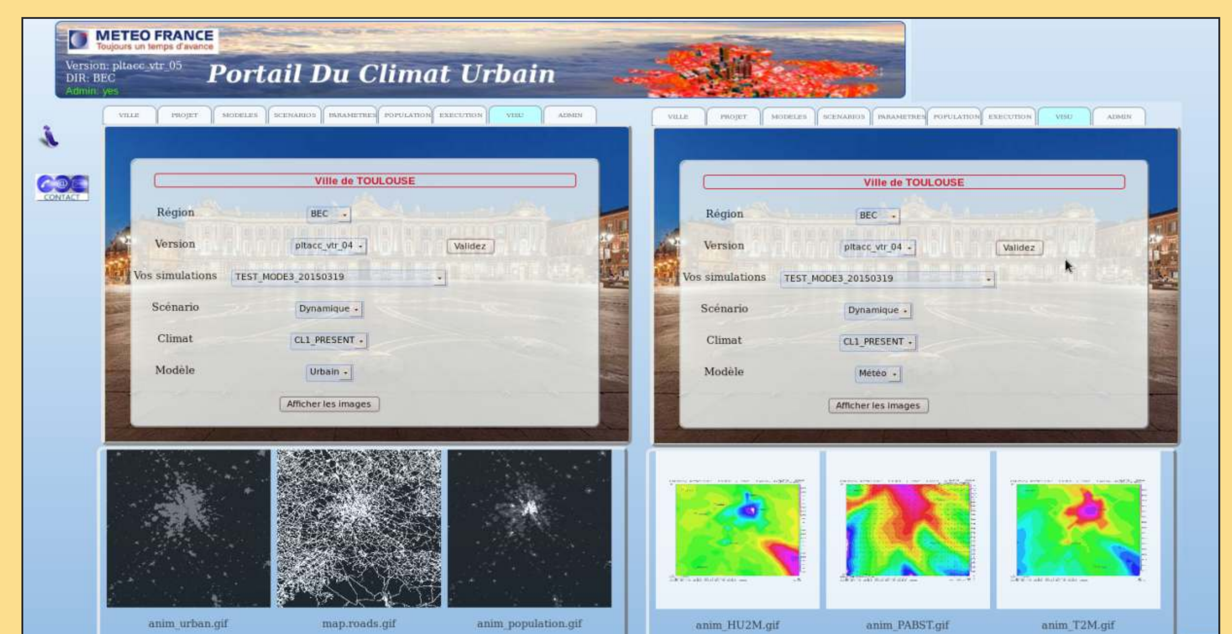
User interface : visualization of some simulated output parameters (to control the simulation)

A set of chronological tabs helps the engineer in the various stages of the preparation: